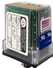
API 4003 G

Potentiometer to DC Isolated Transmitter