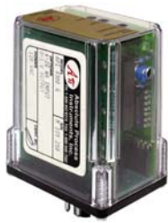
API 4300 G

Solution: API modified versions of their existing DC to DC converter and their Potentiometer to DC con-verter and then assigned customer specific part numbers for the customer.